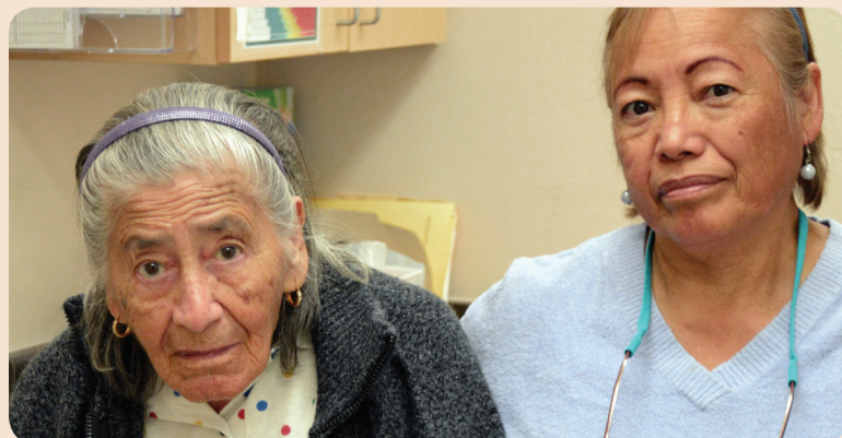
*Provides an in-kind donation of professional services to Maliheh Free Clinic patients