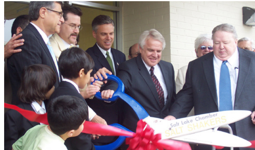
Ribbon cutting for Maliheh Free Clinic in 2005